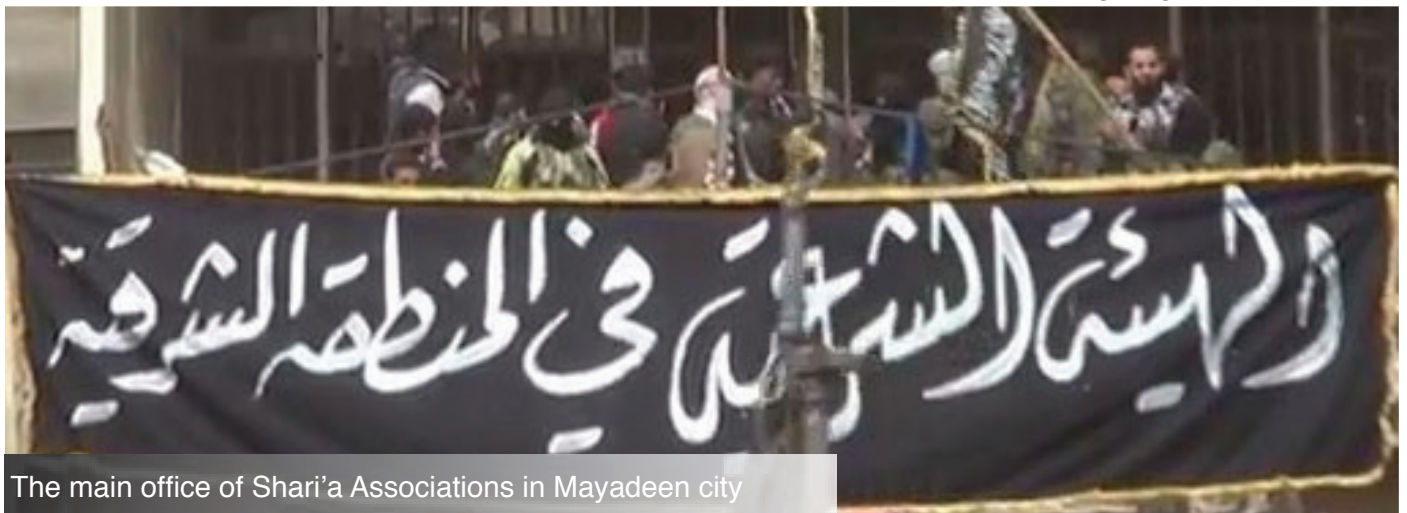
The main office of Shari'a Associations in Mayadeen city

Contrary to the rumors that Al-Nusra had an embedded intention to announce Deirezzor as an Emirate, they in fact has different plans, and that is to establish a Shari'a Association under its auspices, through which it will manage military and civil activities. That was the plan it started implementing in other provinces, including Deirezzor. The establishment of the Shari'a Association was announced on 9/3/2013. Members of the Association included the following: Al-Nusra Front, Mu'ta Brigade, Al-Ikhlās Brigade, Al-Ka'a Ka'a Islamic Brigade, Ibn Al-Qaim Brigade, Rijal Allah Brigade, Yabarek Al-Nasr Faction, Al-Rahbeh faction, both as factions affiliated with the association and formed its executive power. In the first statement of announcing its formation, the Association announced the following, "To facilitate services for the public, and fill the security void, and to resolve the public's hanging issues" 31 . Out of the six departments 32 of which the statement considered a means for achieving its goals, a depart-