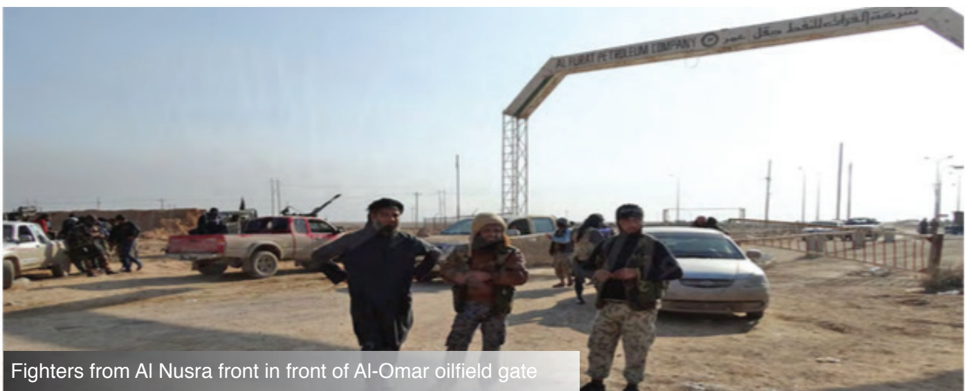
Fighters from Al Nusra front in front of Al-Omar oilfield gate

Some tribal groups and families took things even further, to establish private “free” army factions, Shari'a commissions and revolutionary fronts and armies and Mujahideen gatherings of their own. They also worked to expand the circle of beneficiaries of the oil inside the tribes, and unite against any potential threat that may be posed by the Central Shari'a Commission.