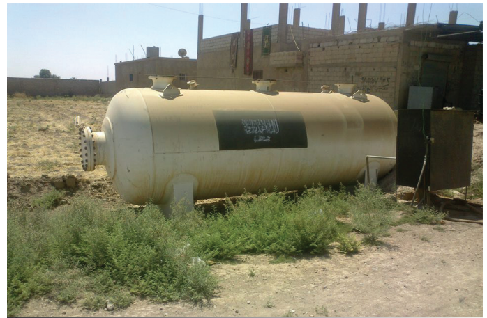
Al Nusra front Gas distribution point in Altayyanah

However, the productivities confirmed, according to the lowest margin of revenue of the wells in the main site for the field, was estimated with 5,000 barrels per day at a minimum, in addition to 7,000 barrels from the vicinity of the site, which were sold for 4000 per barrel (US $ 30-40 at the time). This meant that 360- 480 thousand US dollars a day, was poured into the funding of the factions controlling the field, or into the pockets of its commanders. Added to this figure were the profits of Red gasoline, and quotas of varying size from intermittent partnerships from oil wells that were distributed in different areas. All of which was under the control of the commission, which some former employees insisted that the commission's authority was to be described as a nominal control, purged of any possible affiliations.