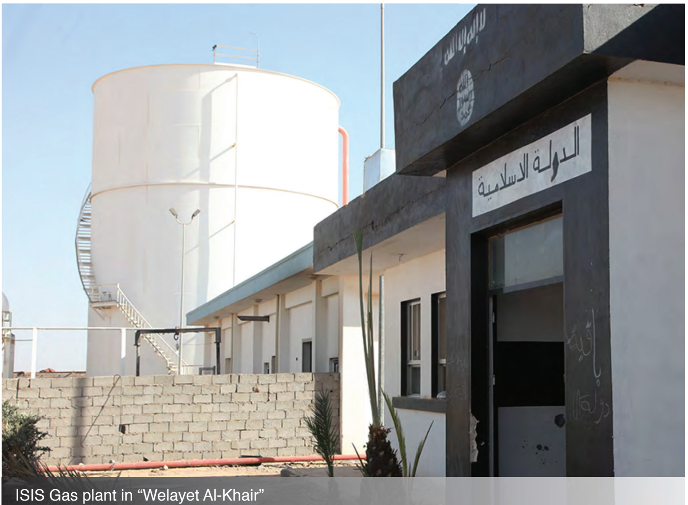
ISIS Gas plant in “Welayet Al-Khair”

It is difficult to predict the future of cooperation or exchange of benefits between the regime and ISIS, as both of them are in a relationship of extreme uniqueness and may be affected by changing conditions. But, in the current level of conflict, this cooperation does not seem threatened by any of those 2 parties.